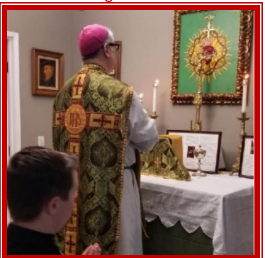
The Hiding Mass in Van Nuys