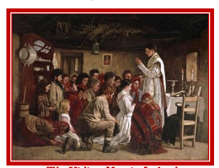
The Hiding Mass in Ireland

If you are unsure how to correctly set your hand missal arrive early for Holy Mass and ask the Monsignor to assist you. It is also important to become familiar with the Ordinary of the Mass, those parts that never change, i.e.: Kyrie, Gloria, Creed, Sanctus, Benedictus, and the Agnus Dei. And of course the Canon of the Mass, and the Propers of the Mass, those which vary according to the feasts of the day, i.e., Introit. Collect(s)(after the Gloria or Dominus Vobiscum), Epistle, Gradual, Alleluia, Tract or Gospel, Sequence, Secret, Communion Verse and Post Communion. On many feasts or days there are Commemorations (additional prayers) at the Collect, Secret and Postcommunion. The careful attention to these prayers and readings will help one enter into a deeper spiritual relationship with the Holy Liturgy, the Saints and Mysteries of God.