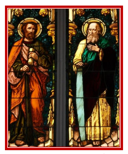
Saints Simon & Jude (29<sup>th</sup> of October): Pray for us! ***********************