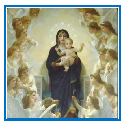
Queen of Heaven re joice: Alleluia!

What a wonderful God we have, Who gives us a Saviour and Redeemer by restoring humanity to His grace and friendship through the actions of Our Blessed Lady! While we can never experience the sublime joy of Our Lady in this life, we can, through her intercession, merits and example, rest in that great and holy joy by living a life as righteous and holy as possible.