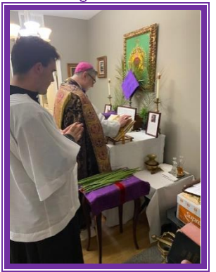
The Hiding Mass in Van Nuys