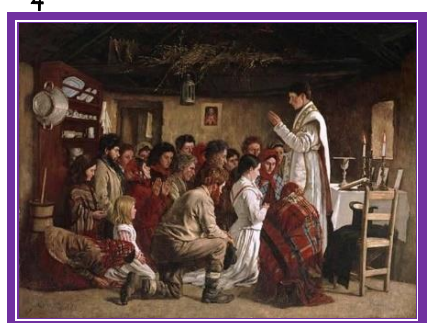
The Hiding Mass in Ireland