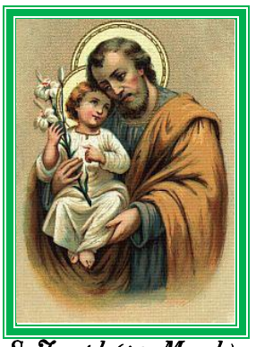
S. Foseph (19 March): Pray for us!

N.B.: Recommendation of a website is for information, and does not constitute association with or full agreement of opinions or positions.