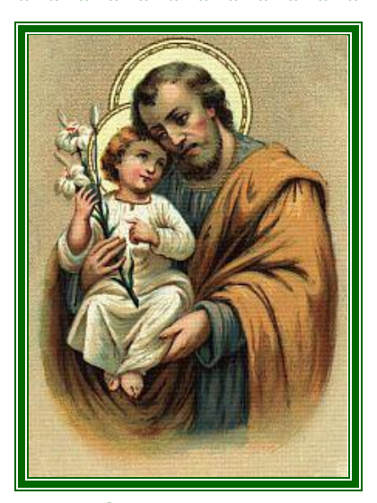
Saint Joseph (19<sup>th</sup> March): Pray for us!