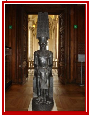
The Statue of Tutankhamun being protected by his namesake in the Louvre Museum, Paris, France, picture taken by the Monsignor himself.

has collected, preserved and displayed such art for centuries.