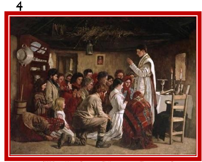
The Hiding Mass in Ireland,

Sunday Mass Time: (please call or email for current Mass time and location) (818) 786-2540 e-mail: info@stfrancisoratory.org