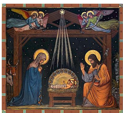
And the Word was made flesh, and dwelt amoung us!

The other great devotion every Catholic must have is to the Holy Mass. With this in mind let us consider more about this very important devotion: devotion to the Holy Mass begins with understanding it, especially the actions, prayers and readings of the Mass. The greatest tool for understanding the Holy Mass is a proper Hand Missal: the only two that I recommend are the Saint Andrew's and the Father Lasance. After obtaining a proper hand missal you should explore it and read all the Liturgical Notes that accompany all the readings of the feasts. Without an hand missal one cannot properly pray the Holy Mass, and without praying at Holy Mass one is simply an inactive "passerby" missing the graces and wonders of a deeper spiritual life.