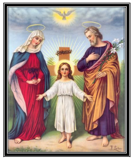
Feast of the Holy Family (10<sup>th</sup> January): Pray for us!