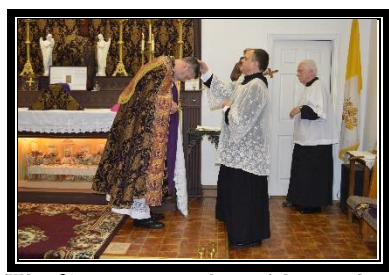
The Clergy receive their Ashes on their crown