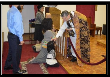
One is never too young to participate in the Life of the Holy Church

The 26<sup>th</sup> of February 2020 is Ash Wednesday , the beginning of Great Lent . Holy Mass preceded by the Blessing and Distribution of Ashes will take place at 7:00 pm.