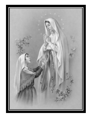
Our Lady of Lourdes (11<sup>th</sup> of February): Pray for us!