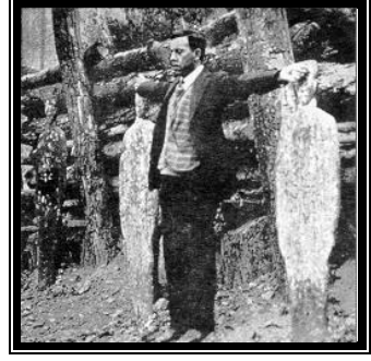
Diguel Pro, at his execution