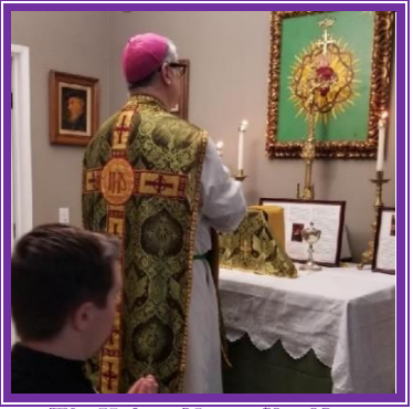
The Hiding Mass in Van Nuys