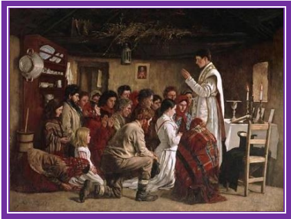
The Hiding Mass in Ireland