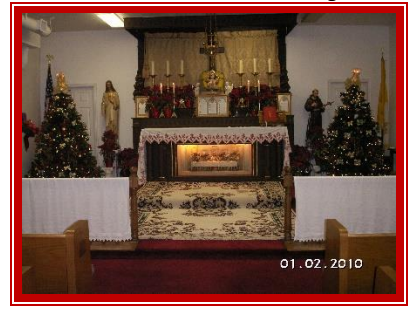
Saint Francis Exchange

Sunday Mass Time: 10:00 am – Parochial Mass with Homily Daily Mass Times: Tuesday through Saturday 8:00 am First Friday 7:00 pm Confessions one half of an hour before Holy Mass 16826 Saticoy Street Entrance and Parking around back Van Nuys, CA 91406-2776 (818) 786-2540 e-mail: info@stfrancisoratory.org