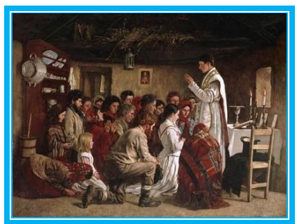
The Hiding Mass in Ireland

the Monsignor to assist you. It is also important to become familiar with the Ordinary of the Mass, those parts that never change, i.e.: Kyrie, Gloria, Creed, Sanctus, Benedictus, and the Agnus Dei. And of course the Canon of the Mass, and the Propers of the Mass, those which vary according to the feasts of the day, i.e., Introit, Collect(s)(after the Gloria or Dominus Vobiscum), Epistle, Gradual, Alleluia, Tract or Sequence, Gospel, Secret, Communion Verse and Post Communion. On many feasts or days there are Commemorations (additional prayers) at the Collect, Secret and Postcommunion. The careful attention to these prayers and readings will help one enter into a deeper spiritual relationship with the Holy Liturgy, the Saints and Mysteries of God.