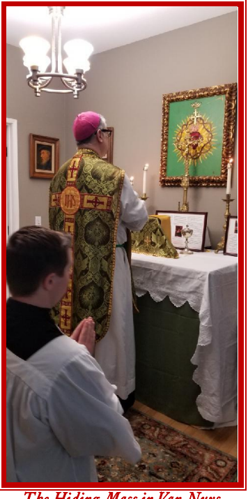
The Hiding Mass in Van Nuys

Sunday Mass Time: (please call or email for current Mass time and location) (818) 786-2540