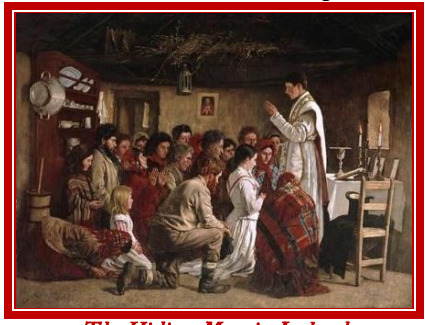
The Hiding Mass in Ireland