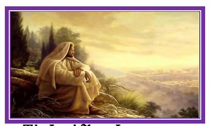
The Lord Jesus Laments over Jerusalem &&&&&&&&

If you have a question, please feel free to e-mail: info@stfrancisoratory.org